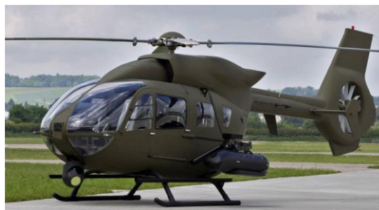
Figure 4 – EC645