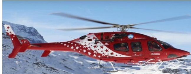
Figure 3 - BELL 429