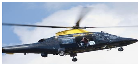
Figure 2 - AW 109